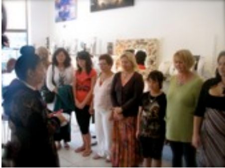
Daily Blessing Ceremony