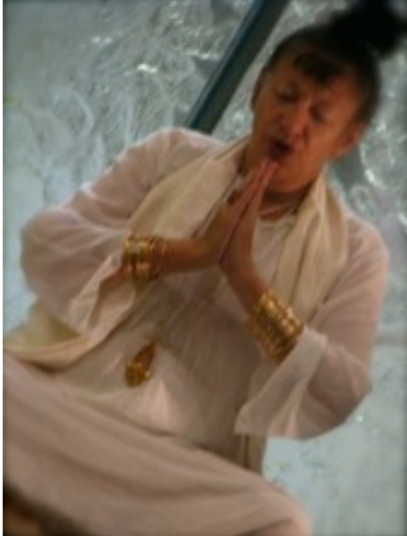
Sound Healing Concert