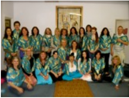
Blue Fire Graduates