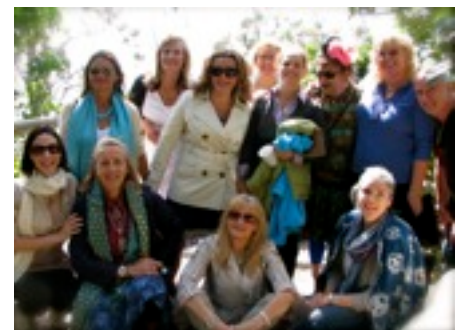
> Blue Fire Students in Byron Bay

Shankari's Blue Fire Tour sure was a Jam-Packed 2 weeks of fun, love, inspiration and transformation with workshops and ceremonies. Thank-you for your continued support in supporting Shankari's vision for our world. Shankari was so well received that she is returning to Atlantis Rising for a 5 DAY TOUR Oct /Nov 2010. Book NOW for Great Accommodation Deals.