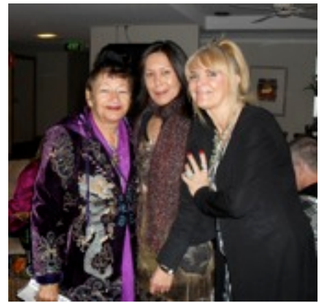
Talismans of Power 21 Years of Business